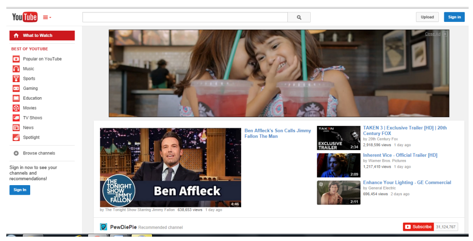
Figure 1. YouTube Homepage

Since this paper specifically explores Web-based video services, the two types of video services available online were considered and include: (1) video viewing services that allow users to view videos, and (2) video sharing services that allow individuals to upload videos and share them with others for commentary. When the top 15 video viewing and sharing services were examined based on overall traffic and number of unique monthly visitors, the results demonstrate the dominance of YouTube with an estimated 1 billion unique monthly visitors compared to the 150 million visitors of the second most popular video viewing Website Netflix, or the 120,000,000 of the next two most popular video sharing services Yahoo Screen and Vimeo (eBizMBA, 2013). While there are over 50 video sharing services in existence, YouTube is without question the goliath and is both is phenomenally popular with, as well as familiar to, the current generation of learners (Buzzetto-More N. , 2014). Additionally, because it is the second most common place individuals go one the Web to locate information (Buzzetto-More, 2013a), it is the only video sharing services under consideration as part of the study currently being discussed.