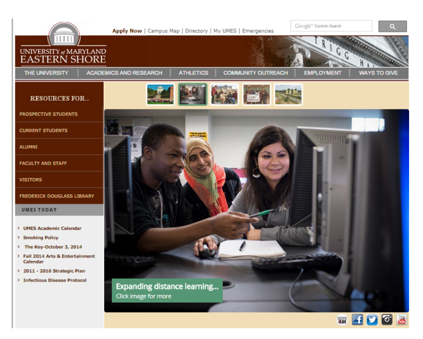
Figure 4. University of Maryland Eastern Shore Website